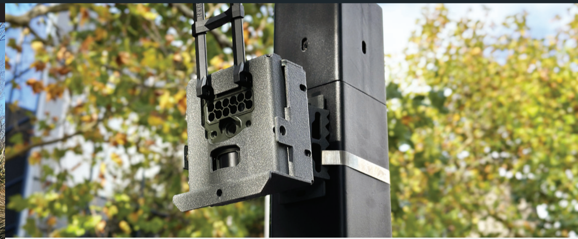
Image capture flexible mounting

Adroit field image cameras can be installed on public infrastructure, street poles, walls and other surfaces at a recommended install height of 3.5+ meters, minimising risk of theft and tamper. For remote environmental monitoring equipment can be mounted to poles, posts and trees.